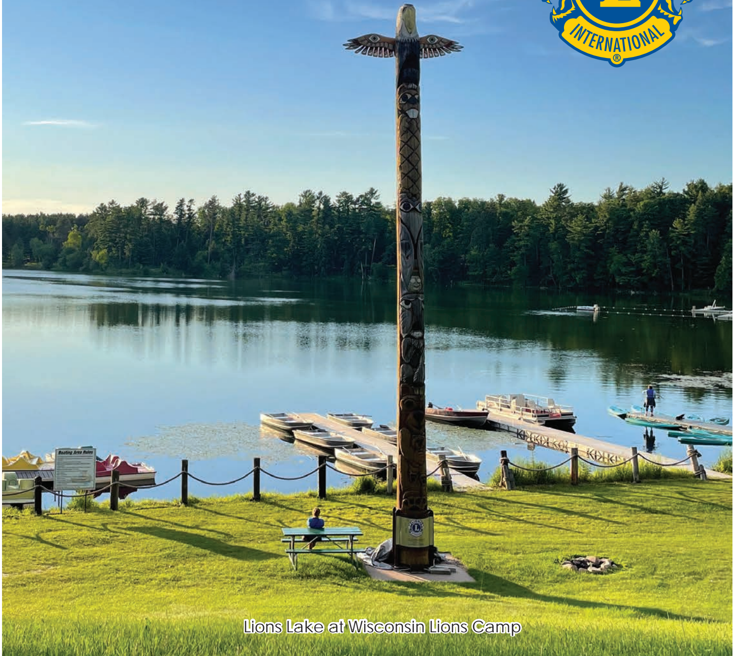
Lions Lake at Wisconsin Lions Camp